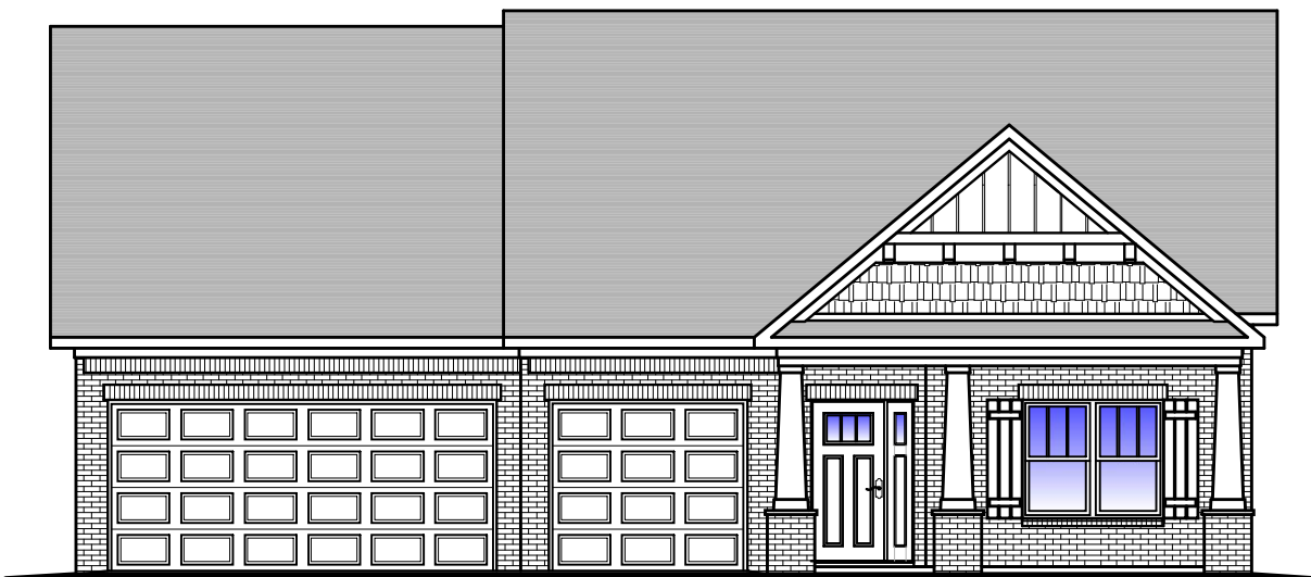
"WELLINGTON" - ELEVATION "D" CRAFTSMAN NOT TO SCALE 1,826 SQ. FT. (FINISHED)