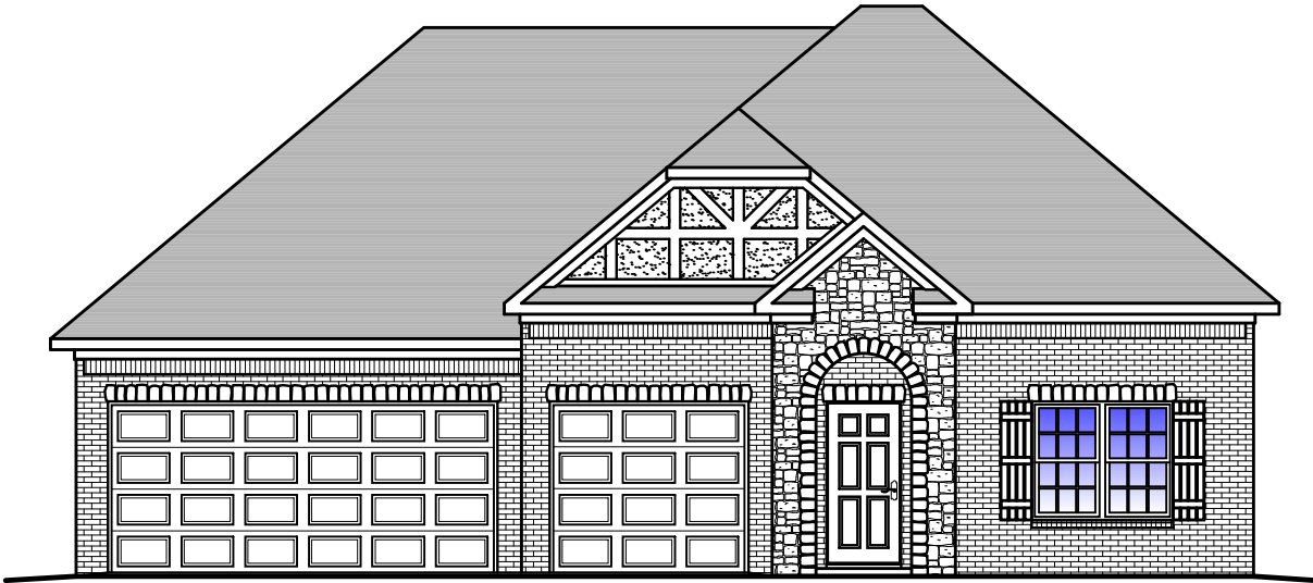
"WELLINGTON" - ELEVATION "C" TUDOR NOT TO SCALE 1,826 SQ. FT. (FINISHED)