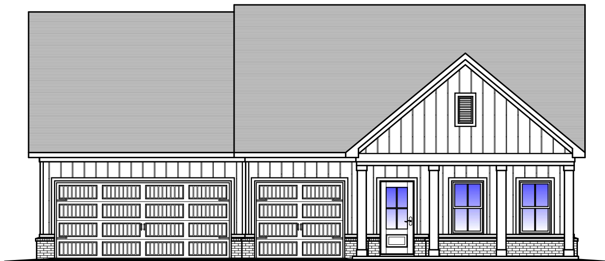
"WELLINGTON" - ELEVATION "B" FARMHOUSE NOT TO SCALE 1,826 SQ. FT. (FINISHED)