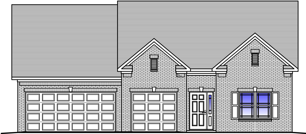
"WELLINGTON" - ELEVATION "A" TRADITIONAL NOT TO SCALE 1,826 SQ. FT. (FINISHED)